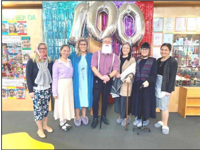
"Our wonderful Prep Teachers joining in the celebration"