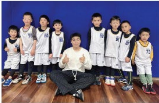
Serpell Slum Dunk

Here is a photo collection of all our basketball teams' achievements from the past season.