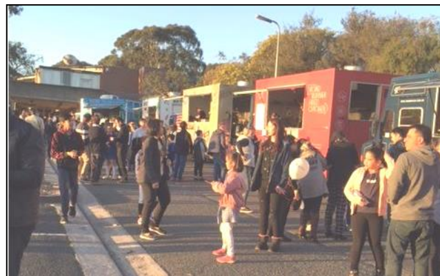
Everyone enjoying the Food Trucks

The School Captains and Year 6 students have announced that it is "Marble Season." This happens each year and will last for two weeks until the end of term. For the children this is such a fun part of school life and culture as they are part of hundreds of frenetic people playing marbles in a very small play area. Students should only bring inexpensive marbles as they get lost or roll away. It is also a very good gambling lesson. If they risk betting, they risk losing. The only rule is that students can only play against students at their own year level.